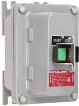
B7MS1P Push Button Style