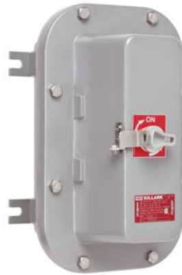
B7MS2R Rotary Style

Class I, Div. 1 & 2, Groups B,C,D Class I, Zones 1 & 2, Groups IIB+H2, IIA Class II, Div. 1 & 2, Groups E,F,G Class III, Div. 1 & 2 NEMA 3, 4, 4X, 7(B,C,D) 9(E,F,G)